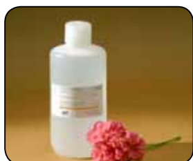
10X CE Buffer with EDTA Each lot is function tested.