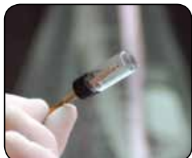
Regenerate your used array for a fraction of the cost of a new one. Compatible with all array types.