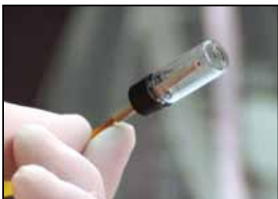
Regenerate your used array for a fraction of the cost of a new one. Compatible with all array types.