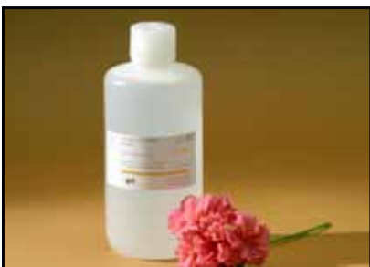
10X CE Buffer with EDTA Each lot is function tested.