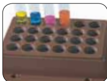
CAT# TMB-D, $419