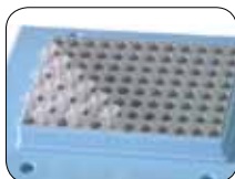
CAT# TMB-C, $419